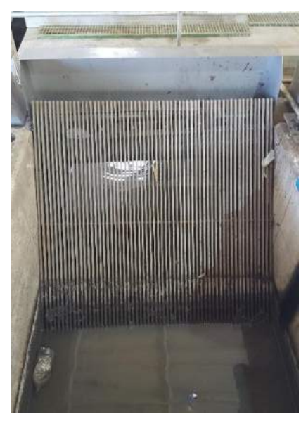
Fixed manual bar screen

The advantage of this solution is a high life time due to low mechanical components.