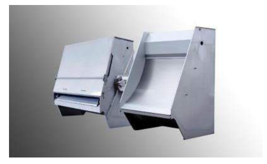
STATIC SCREEN with or without covers